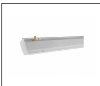
TYTAN LED 1150mm 2500lm 840 - lighting module (2018.09) (909016)