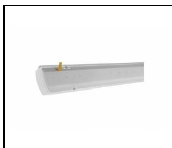
TYTAN LED 1150mm 2300lm 830 - lighting module (2018.09) (909009)