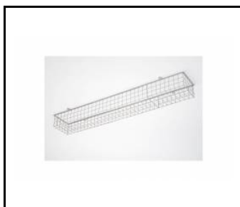
TYTAN LED, ATLAS LED - protective grid 1432mm (907920)