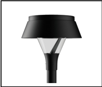
SKVER Hood ULR example 2 RAL9005 (421518)