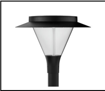
SKVER Hood example 1 RAL9005 (435522)