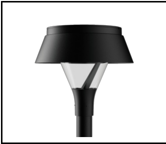
SKVER Hood ULR example 2 RAL9005 (421518)