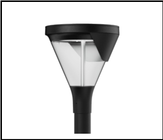
SKVER Backshield RAL9005 (435515)