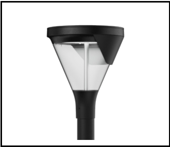
SKVER Backshield RAL9005 (435515)