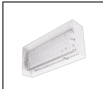
Protective cover for Orion LED luminaires (897191)