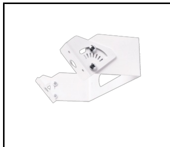
Angle assembly kit 0-90 ORION (897184)