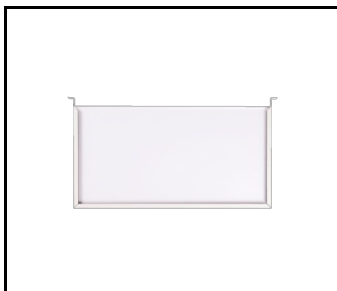
DS ORION LED II double sided frame (897214)