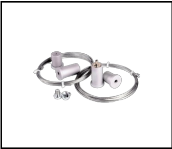
DIRECTO S suspended mounting kit (897238)