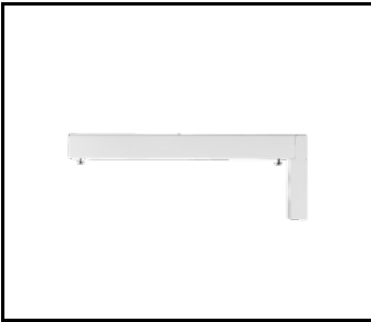
DIRECTO S Flag Mounting Kit (897245)