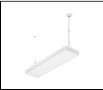
CONTRA LED suspension system 1200x300 (374692)