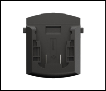
Adapter for Magnum Battery BOSCH / MIL - DEW (NEW) (608803)