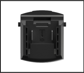
Adapter for Magnum Battery BOSCH / MAKITA (NEW) (608810)