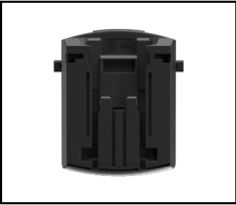
Adapter for Magnum Battery BOSCH / FESTOOL (NEW) (608827)