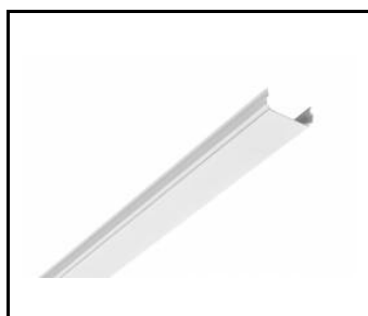
LINEA S LED - PVC grille 1764mm (981159)