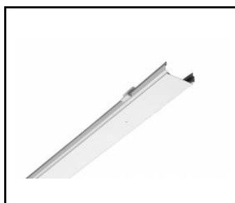
LINEA S LED metal grille 588mm (980985)