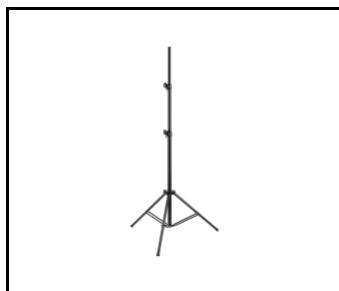
Steel tripod 3 m (000294)