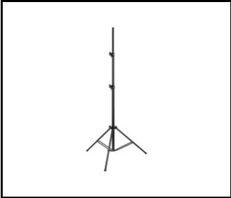
Steel tripod 3 m (000294)