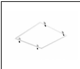
Plasterboard recessing kit 630x630 white (steel version) (999543)