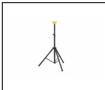
FUTURE STAND Tripod with Click Head System (000737)