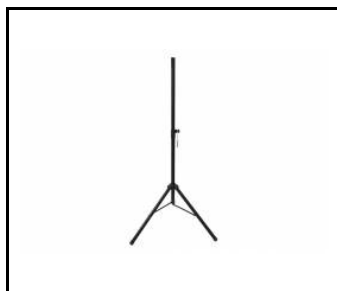
Standard tripod (000720)