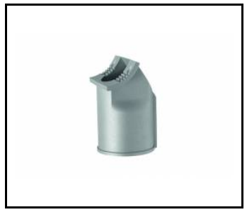
mounting grip 78 mm TIARA LED (UL00184)