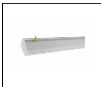
ATLAS LED 1450mm 6000lm 840 - lighting module (952036)