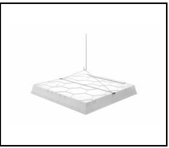
Safety suspension (modular ceiling) (904349)