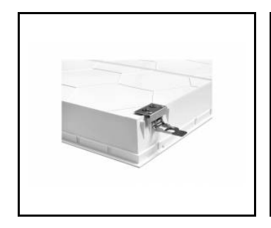
Plasterboard mounting brackets (4 pcs) (630033)