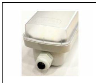
M16 stuffing box plug various PA black M-16 - BPM-21 (60000006)