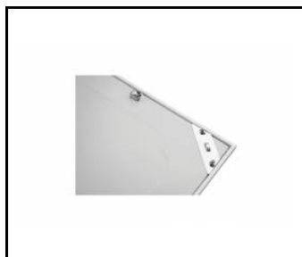
PLANO LED EVO 1