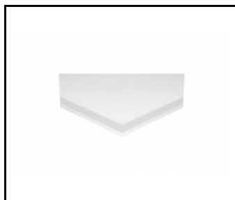
PLANO LED EVO DETAL 2