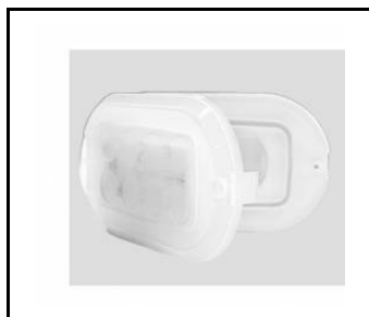
Oval LED Basic 840 (4.7W) light module (233661)