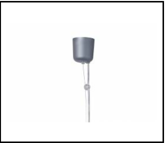
SINGLE ELECTRICAL SUSPENDE D CORD (ROUND BOX) TABLO NT (171703)