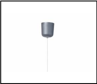
SINGLE SUSPENDE D CORD (ROUND BOX) (171635)