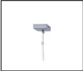
SINGLE ELECTRICAL SUSPENDE D CORD (SQUARE BOX) TABLO NT (171710)