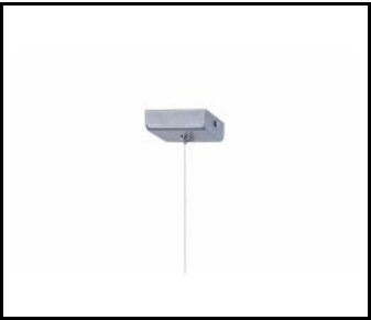
SINGLE SUSPENDE D CORD (SQUARE BOX) (171642)