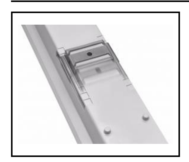
regulowane uchwyty / adjustable handles / einstellbare Halterungen