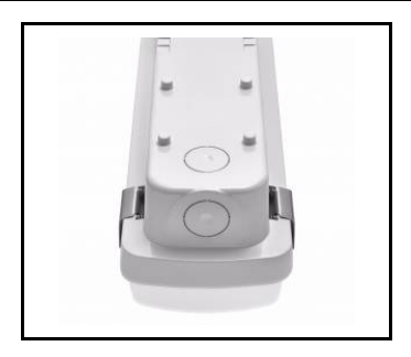
wybór miejsca zasilania / choosing a place of power supply / Stromversorgungsanschluss von mehreren Seite möglich