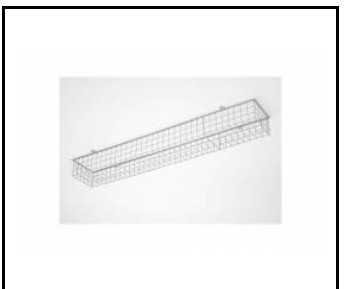
TYTAN LED. ATLAS LED - protective grid 1152mm (907913)