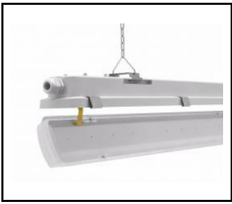
system zwieszania klosza / suspension system of the diffuser / hängende Diffusor