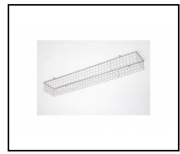
TYTAN LED. ATLAS LED - protective grid 1432mm (907920)