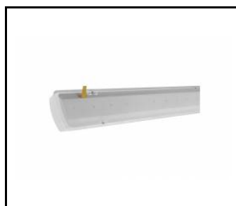
TYTAN MULTI LED 1450mm 6300-10800lm 840 - lighting module (358968)