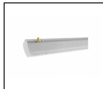
TYTAN MULTI LED 1150mm 2500-4300lm 840 - lighting module (358937)