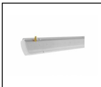
TYTAN MULTI LED 1150mm 5000-8700lm 840 - lighting module (358944)