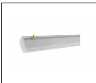
TYTAN MULTI LED 1450mm 3150-5450lm 840 - lighting module (358951)