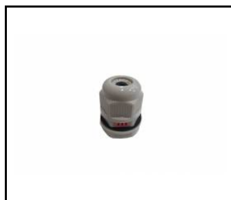
Breathable gland gray M20*1.5 IP68 (16000507)