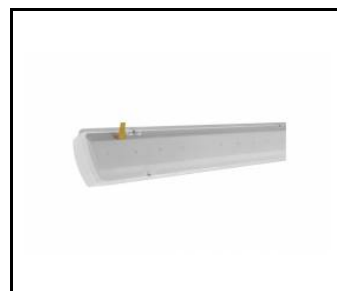
TYTAN MULTI LED 1150mm 2500-4300lm 840 - lighting module (358937)