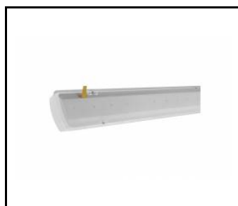
TYTAN MULTI LED 1450mm 6300-10800lm 840 - lighting module (358968)