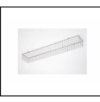
TYTAN LED. ATLAS LED - protective grid 1432mm (907920)