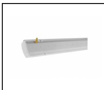
TYTAN MULTI LED 1450mm 3150-5450lm 840 - lighting module (358951)