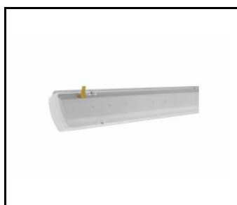
TYTAN MULTI LED 1150mm 5000-8700lm 840 - lighting module (358944)