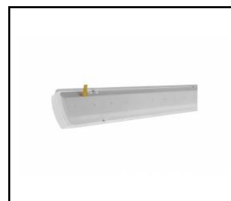
TYTAN MULTI LED 1150mm 2500-4300lm 840 - lighting module (358937)