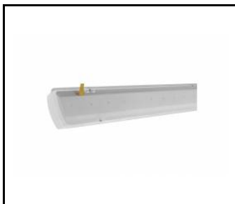
TYTAN MULTI LED 1150mm 5000-8700lm 840 - lighting module (358944)