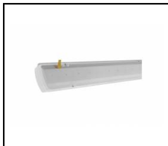
TYTAN MULTI LED 1450mm 3150-5450lm 840 - lighting module (358951)