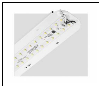
TYTAN MULTI LED 1450mm 3150-5450lm 840 - lighting module (358951)