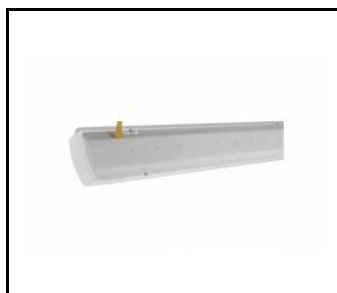
TYTAN MULTI LED 1450mm 3150-5450lm 840 - lighting module (358951)