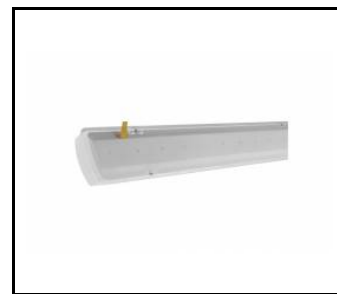
TYTAN MULTI LED 1150mm 2500-4300lm 840 - lighting module (358937)