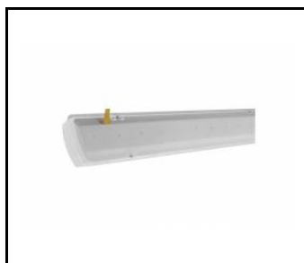
TYTAN MULTI LED 1150mm 5000-8700lm 840 - lighting module (358944)