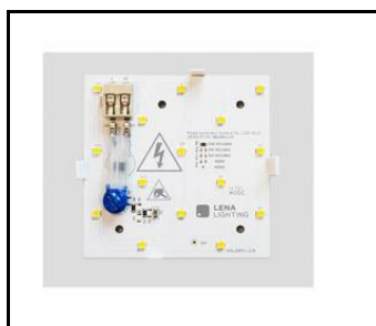
Gamma LED Basic 280 1000lm 840 (10W) - light module (754951)