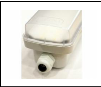
M16 stuffing box plug various PA black M-16 - BPM-21 (60000006)