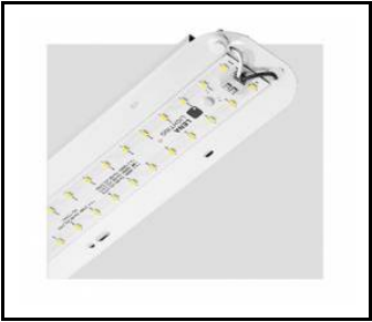
TYTAN LED BASIC 1150mm 7100lm 840 - lighting module (358654)