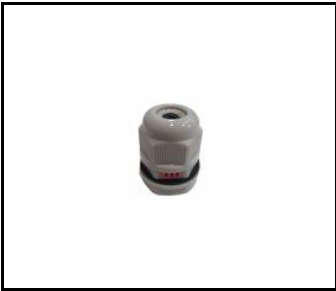
Breathable gland gray M20*1.5 IP68 (16000507)