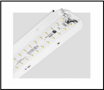
TYTAN LED BASIC 1450mm 7200lm 840 - lighting module (358671)