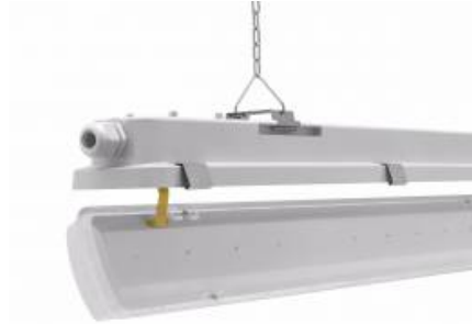
system zwieszania klosza / suspension system of the diffuser / hängende Diffusor