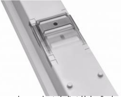
regulowane uchwyty / adjustable handles / einstellbare Halterungen