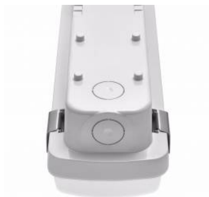
wybór miejsca zasilania / choosing a place of power supply / Stromversorgungsanschluss von mehreren Seite möglich