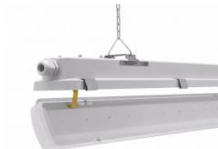
system zwieszania klosza / suspension system of the diffuser / hängende Diffusor