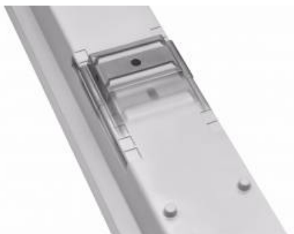
regulowane uchwyty / adjustable handles / einstellbare Halterungen