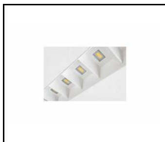
TERRA 2 LED