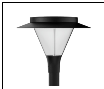
SKVER Hood example 1 RAL9005 (435522)