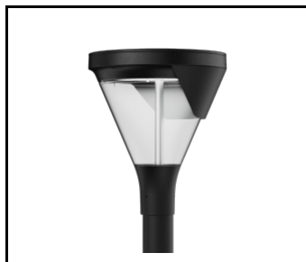
SKVER Backshield RAL9005 (435515)