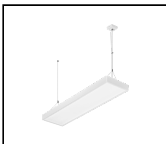
CONTRA LED suspension system 1200x300 (374692)