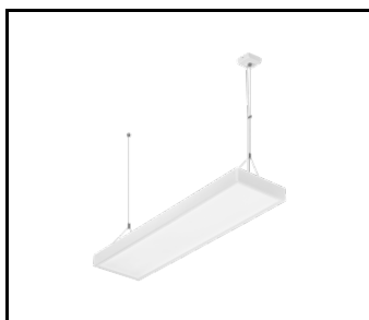
CONTRA LED suspension system 1200x300 (374692)