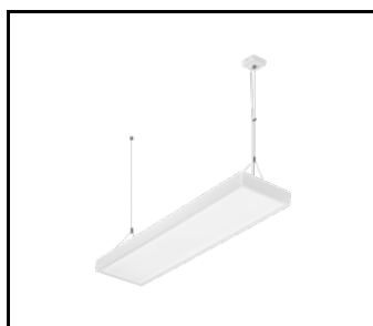
CONTRA LED suspension system 1200x300 (374692)