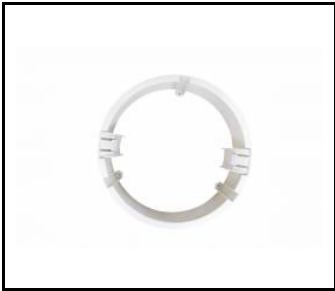
NECTRA LED IP44 20W / 25W SURFACE CASEING PC (ø220 / 70) (059995)