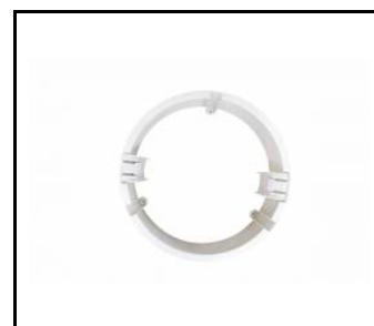
NECTRA LED IP44 20W / 25W SURFACE CASEING PC (ø220 / 70) (059995)