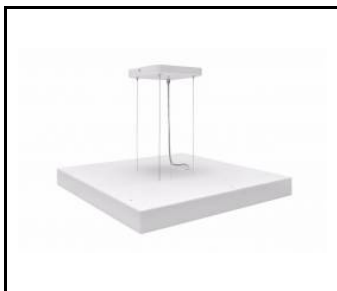
COMPACT LED EVO Z - SYSTEM ZWIESZANIA