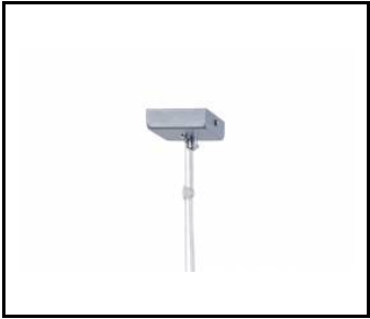
SINGLE ELECTRICAL SUSPENDED CORD (SQUARE BOX) (171574)