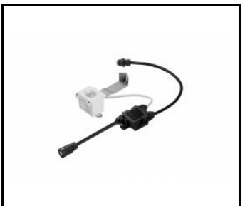
OCULUS LED - RCR / PIR DALI motion sensor (963674)