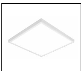
PLANO LED Frame for surface mounting (powder coated steel sheet) - (607mm x 607mm x 47mm; mounting dim.: 562mm x 114mm) (314421)