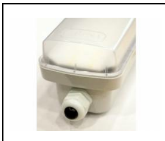
M16 stuffing box plug various PA black M-16 - BPM-21 (60000006)