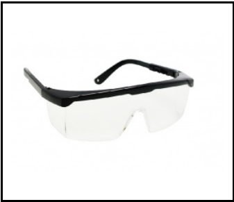
UV-C protective glasses (243639)