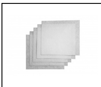
HEPA H10 filter - set of 5 only for the Flow model (243677)