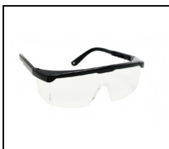
UV-C protective glasses (243639)