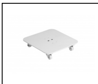
Set of guide wheels Sterilon Flow 72W matt white (243646)