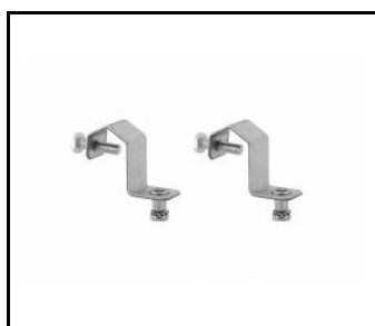
INDUSTRY LED pendant hook on wire (pack of 2) (543944)