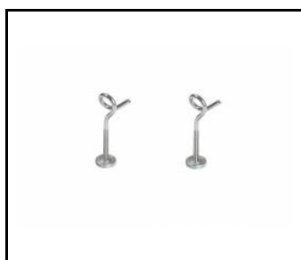
INDUSTRY LED suspension cord for chain (pack of 2) (541247)