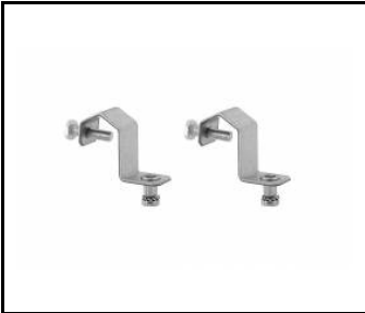
INDUSTRY LED pendant hook on wire (pack of 2) (543944)