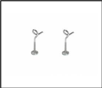
INDUSTRY LED suspension cord for chain (pack of 2) (541247)