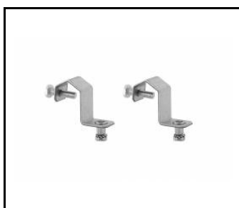
INDUSTRY LED pendant hook on wire (pack of 2) (543944)