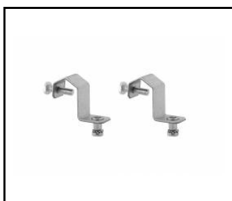
INDUSTRY LED pendant hook on wire (pack of 2) (543944)