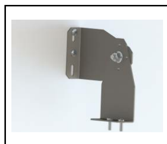
TYTAN LED. ATLAS LED. INDUSTRY LED - adjustable handle (set of 2) (908200)