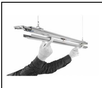
LINEA 3 LED