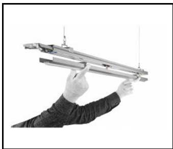
LINEA 3 LED