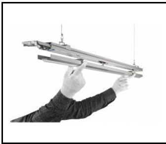
LINEA 3 LED